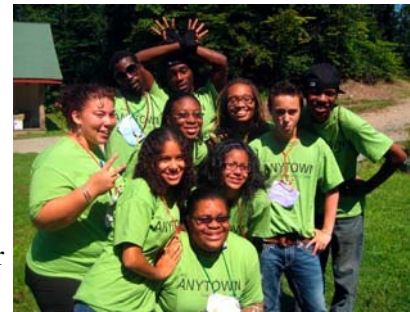
ANYTOWN delegates August 2008