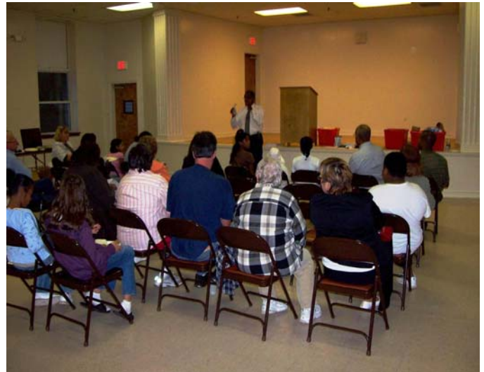
Mayberry Village Residents gather to hear a presentation on recycling from Northeast Utilities.