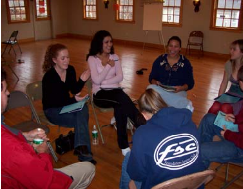
BRIDGES participants at Easthampton High School in CT interact during a group dialogue session.

A newsletter of the National Conference for Community and Justice of Connecticut and Western Massachusetts, Inc. Founded in 1927 as the National Conference of Christians and Jews